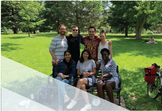
Ohio State Fulbrighters gather at Goodale Park