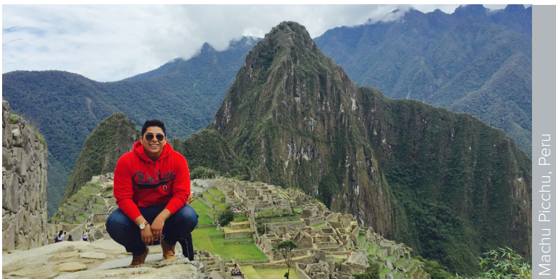
Machu Picchu, Peru